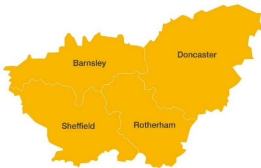
South Yorkshire Police districts

Our investigations found systemic issues/failings in police practice in the following areas of South Yorkshire Police (Rotherham District): leadership, professional curiosity, skills and training, crime recording, multi-agency working, culture, working with victims and survivors.